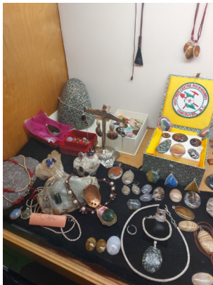
#20L Midori.