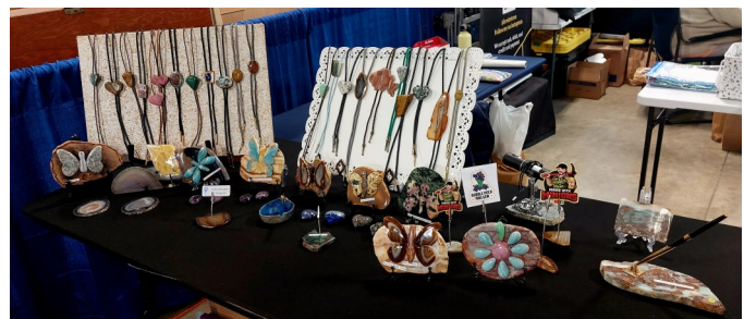
Bolo Ties and Butterflies.