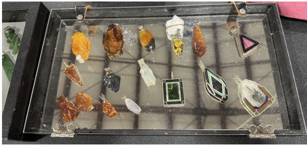
Some of Guenter's work. Photo: Paul