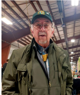
Bolo Buddy.