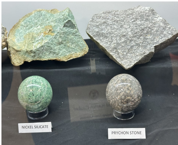
HCR Club Stone.