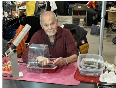
Guenter demo table.