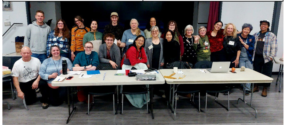
Figure 1 2025 HRC Executive