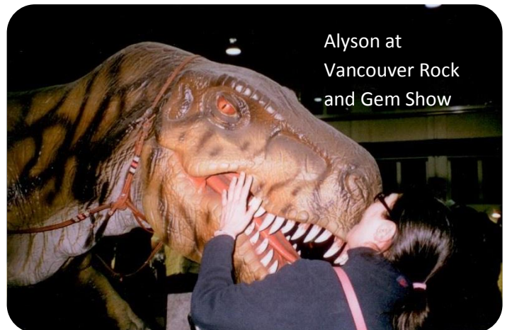
Alyson at Vancouver Rock -and Gem Show