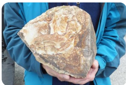
(left) A piece of the devastating Hope Rock Slide the occurred in 1965.