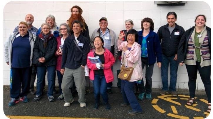
The Gang in front of the Hope Curling Club (Venue for Rendezvous 2016).

Rainy Hope couldn't keep these Rockhounds from Rendezvous this year!